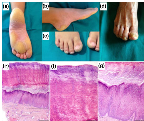
Figure 1. (a) Focal plantar keratoderma in a 13-year-old male patient (#108). (b) Focal plantar keratoderma in the same patient. (c) A 7-year-old male patient (#117) with focal keratoderma and no nail involvement. (d) Hypertrophic nails that had appeared after local trauma in a 72-year-old female patient (#106). (e–g): skin biopsy taken from the affected area with a 4-mm punch. (e) Low-power magnification view of the entire biopsy stained for H&E. (f–g) The insets taken from (e) at higher magnification showing the hyperkeratosis area and the epithelium, respectively. Scale bar is 500 \mu\text{m} in panel e and 200 \mu\text{m} in panels f–g.

obtained applying theoretical methods implemented in several in silico sequence-based tools (reviewed in 11). Here, we have analysed p.Leu421Pro and results show that this change is as pathogenic as other disease-causing mutations found previously in KRT16 (Table S1). For this analysis, four previously reported recurrent KRT16 mutations were considered as ‘positive controls’. In addition, two other fictitious mutations affecting less conserved positions were also analysed as putative ‘negative (or non-disease causing) controls’, validating this method.